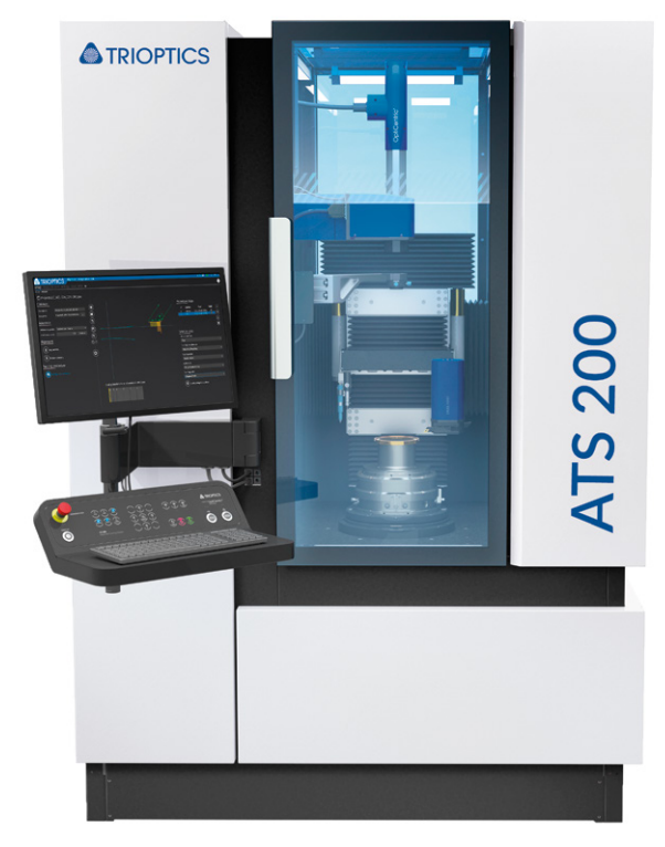
The alignment turning station ATS 200 by TRIOPTICS

The image quality of an optical system depends on the precise centering of its lenses, among other factors. In conventional pro-